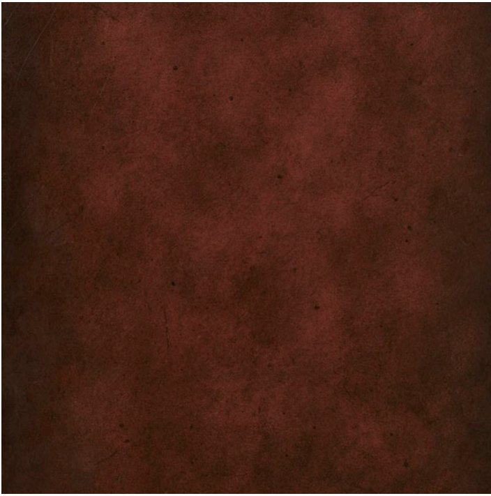
OXBLOOD RED - DISTRESSED