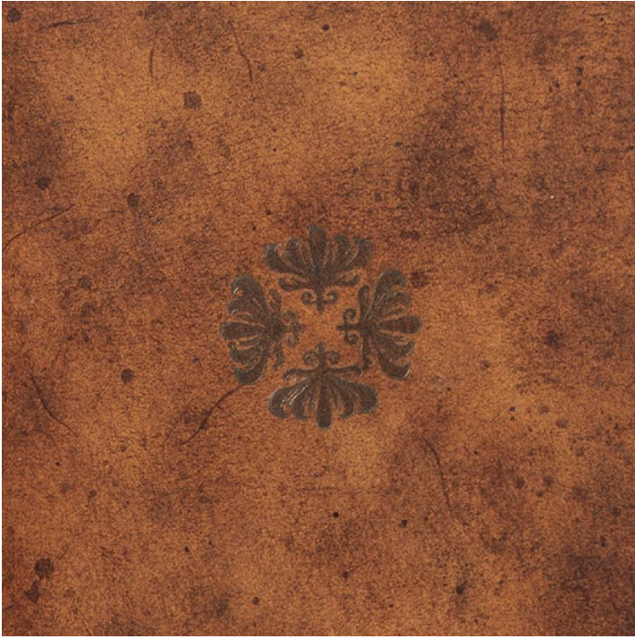
BUFFALO BROWN - DISTRESSED