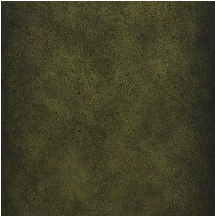
ASHDOWN GREEN - DISTRESSED